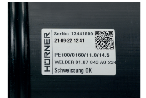
Tag printer and label tags

Immediate quality labeling of every welded joint is possible with the optional dedicated tag printer that delivers an abrasion-proof plastic sticker which can be used as a label on the fitting or joint.